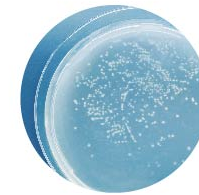
一般纖維養菌結果 Normal PET